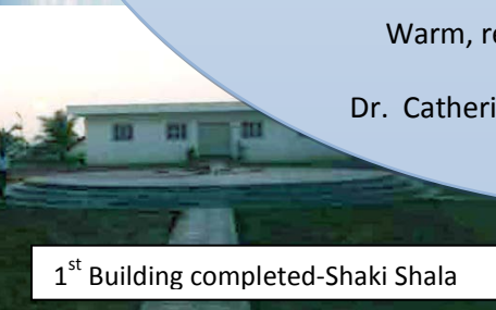
1 st Building completed-Shaki Shala