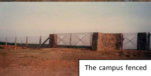
The campus fenced