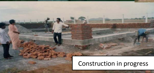
Construction in progress