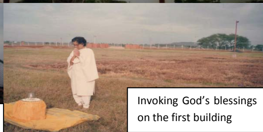
Invoking God's blessings on the first building